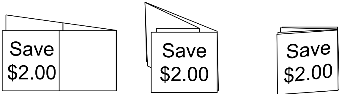
Onsert Folding Pattern