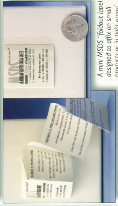
A mini MSDS "foldout label" designed to affix on small products or in tight areas!