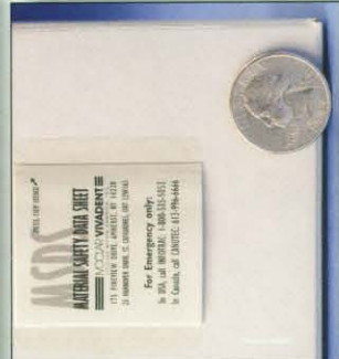
A mini MSDS "foldout label" designed to affix on small products or in tight areas!