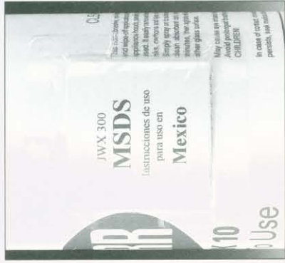
We can do Multilingual MSDS, too!

For MSDS samples, place your business card on the back of this card, photocopy and fax to: